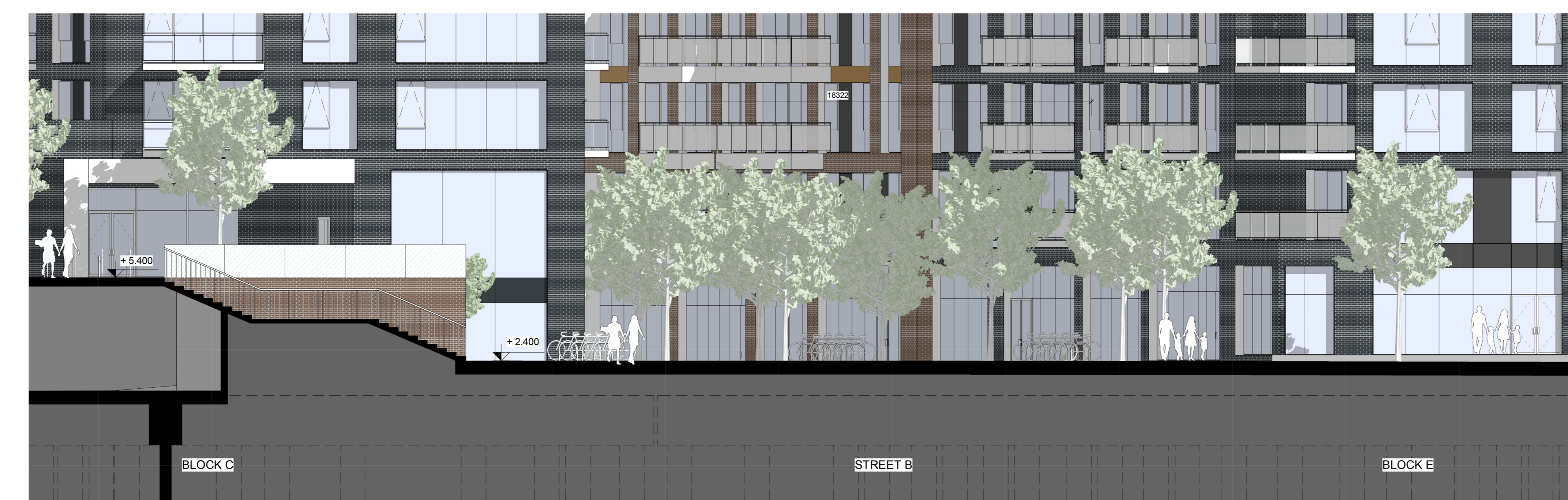
2 CONTEXTUAL SITE SECTION C-C - DETAIL 1:100