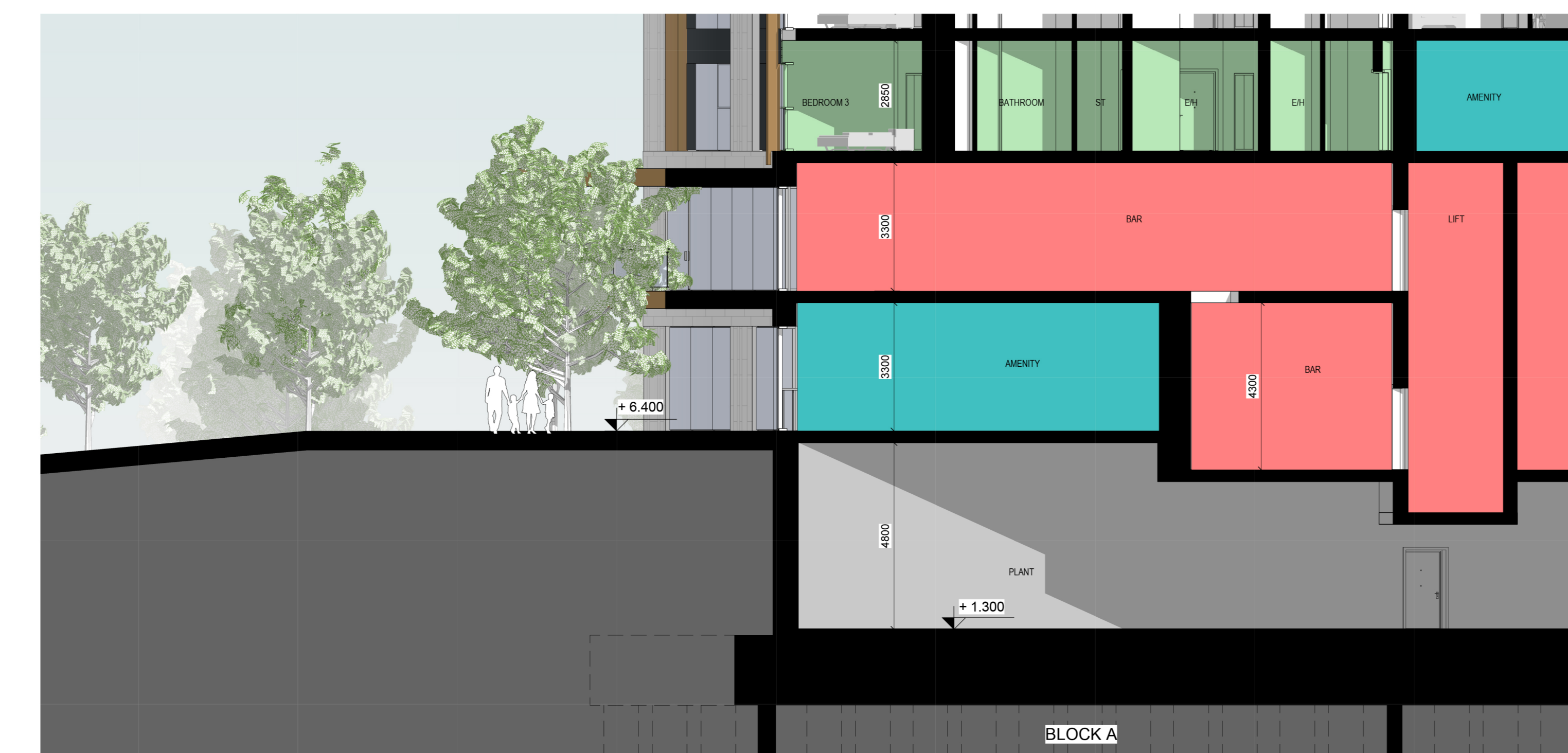
3 CONTEXTUAL SITE SECTION C-C - DETAIL 1:100

THE COPYRIGHT OF THIS DRAWING IS VESTED WITH C+W O'BRIEN ARCHITECTS LIMITED AND MUST NOT BE COPIED OR REPRODUCED WITHOUT THE CONSENT OF THE COMPANY. FIGURED DIMENSIONS ONLY TO BE TAKEN FROM THIS DRAWING. DO NOT SCALE. ALL CONTRACTORS MUST VISIT THE SITE AND BE RESPONSIBLE FOR CHECKING ALL SETTING OUT DIMENSIONS AND NOTIFYING THE ARCHITECT OF ANY DISCREPANCIES PRIOR TO ANY MANUFACTURE OR CONSTRUCTION WORK.